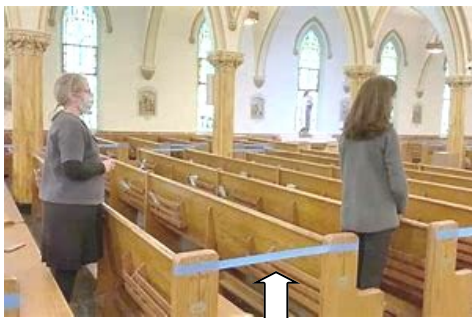
Look for blue tape, marking off pews for safe social distancing.

Your Session has decided to return to in-person Worship on Sunday, September 6th. This decision has not been an easy one, but it has been an important one. Many factors weigh in this decision, and we have tried to keep our mission and your safety in mind. We were committed to seeing 14 days of decline in testing numbers, particularly the rate of tests that come back positive. We have seen that rate hover around 4% in recent days. That gives us hope.