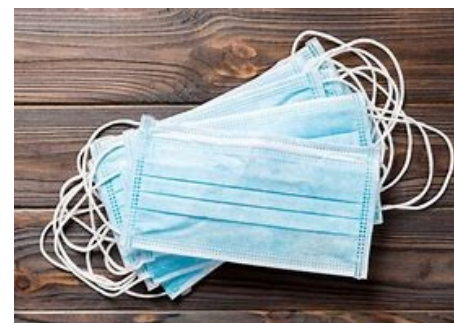
Masks will be required in the church building. One will be provided for you, if you do not have your own.

I encourage you to worship with us online at Facebook.com/NPC until you are comfortable returning to in-person Worship. I encourage all who are in an at-risk category to weigh carefully the decision to return. Please err on the side of caution.