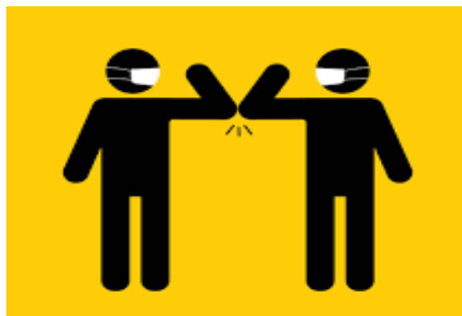
Avoid hugs and handshakes.

Masks will be required. We have some for those who do not have their own.