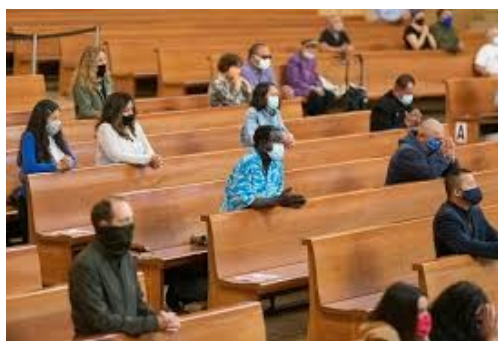
Social distancing: seating in every other pew and space between families.

Masks will be required. We have some for those who do not have their own.