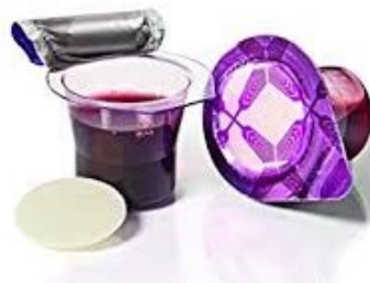
Pre-packaged, sanitary, communion elements will be used - or you can bring your own from home.