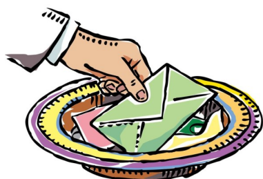
Offering plates will be placed at the door, not passed during the service.